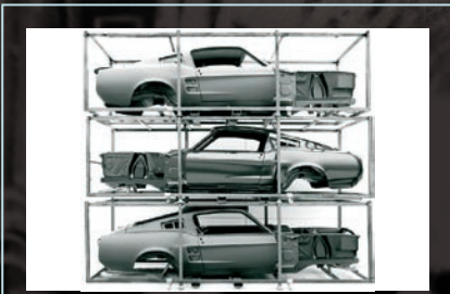
Built using brand new Dynacorn body shells