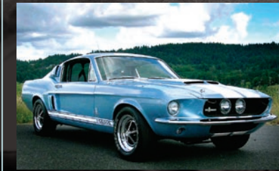
Shelby and 'Eleanor' replica versions available